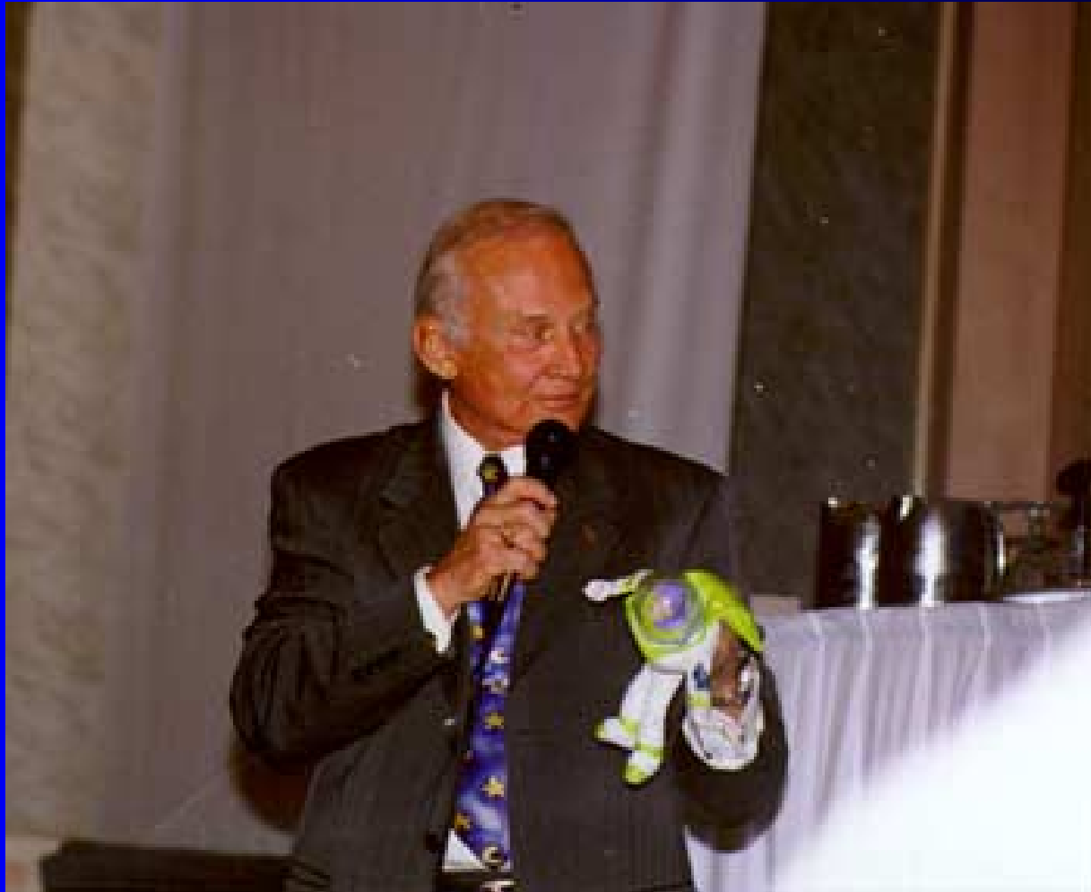
Astronaut Buzz Aldrin, speaking at the Space Tourism Luncheon. Yes, Buzz Aldrin is the "real" Buzz Lightyear