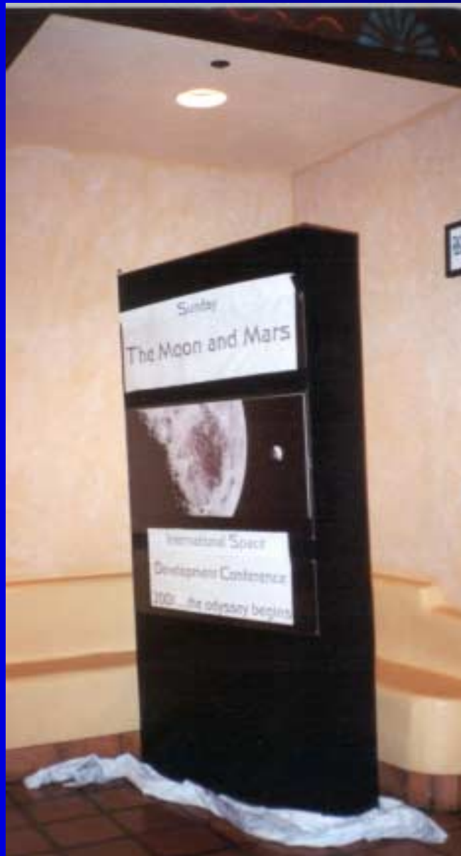
ISDC 2001 “monolith” welcomes attendees on Sunday, May 27, 2001