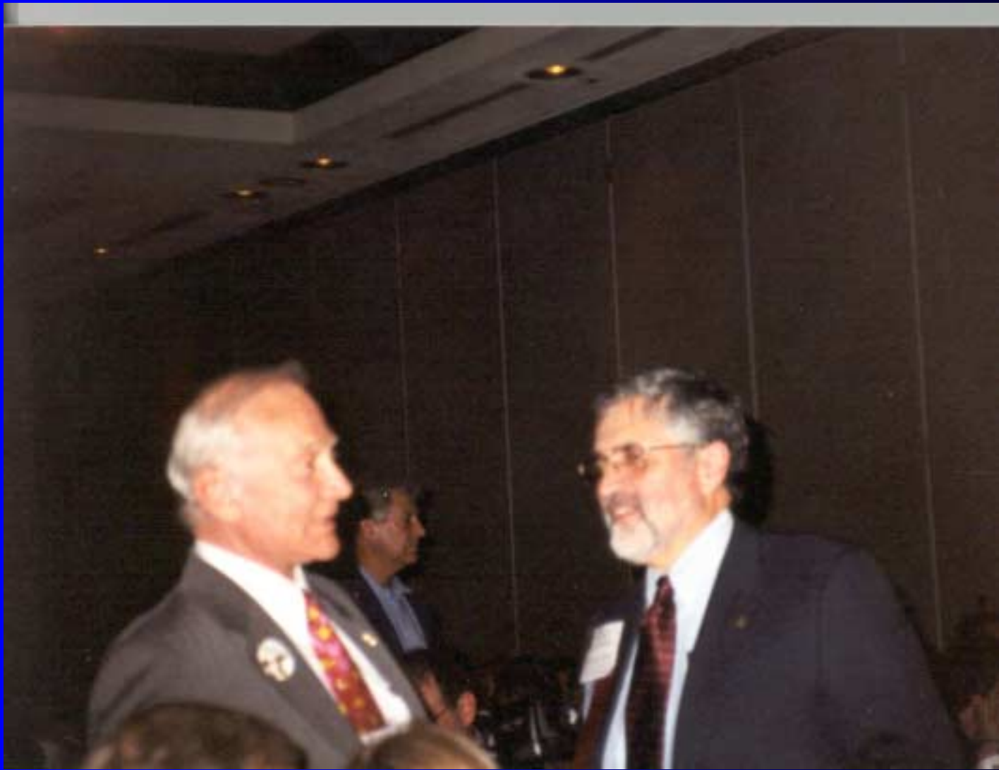
Buzz Aldrin (Apollo 11) and Harrison Schmitt (Apollo 17)