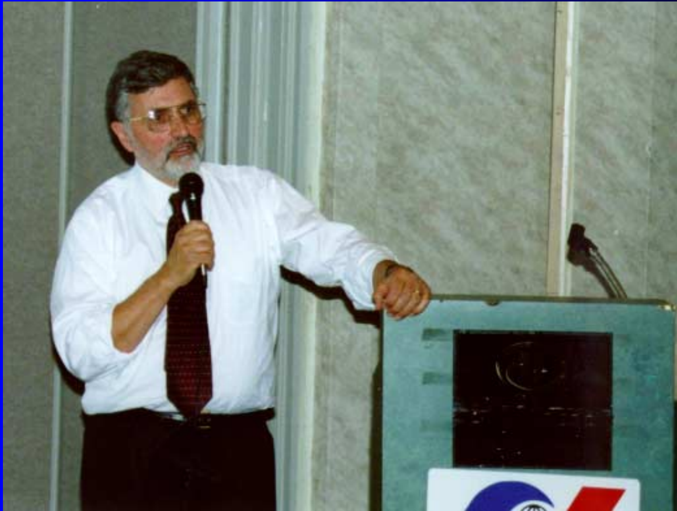
Astronaut Harrison 'Jack' Schmitt giving a talk on Lunar Helium-3 as a 21st Century Energy Alternative