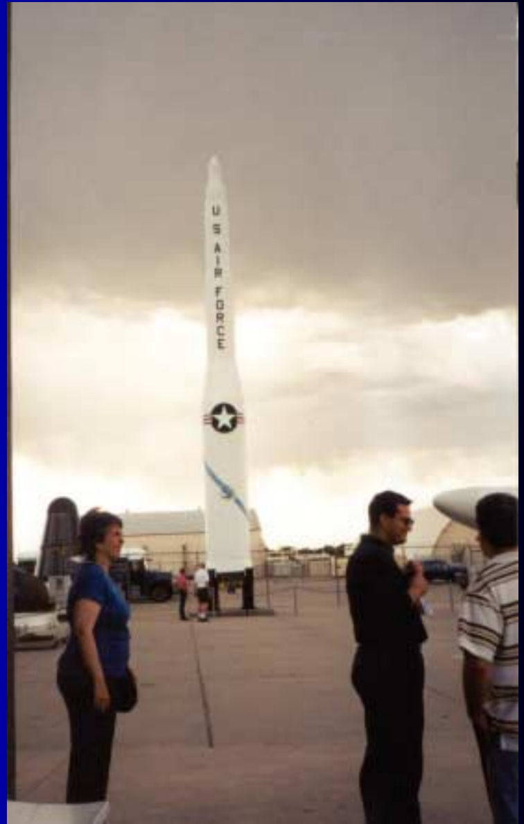
National Atomic Museum Tour