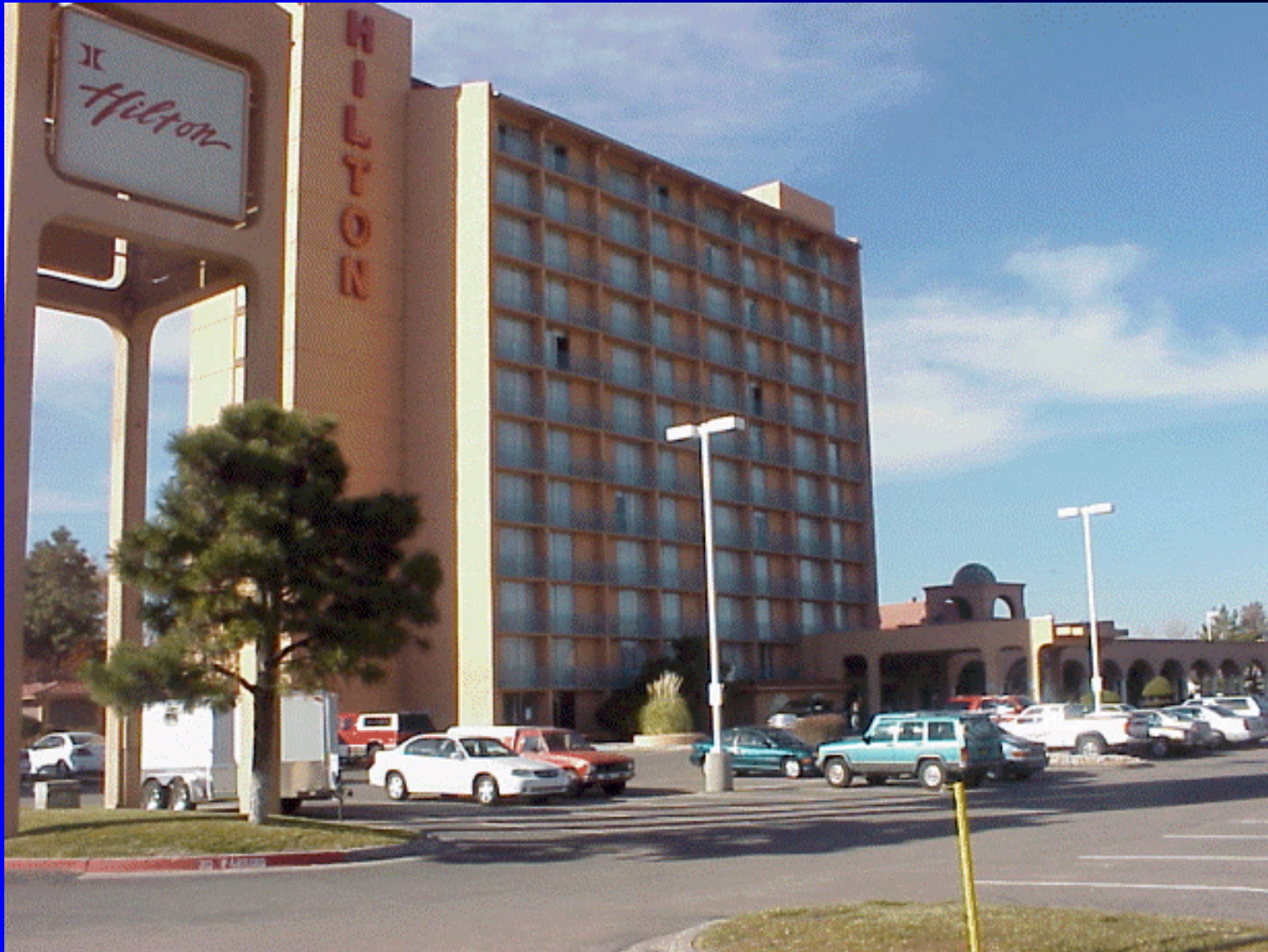
Front view of the Albuquerque Hilton