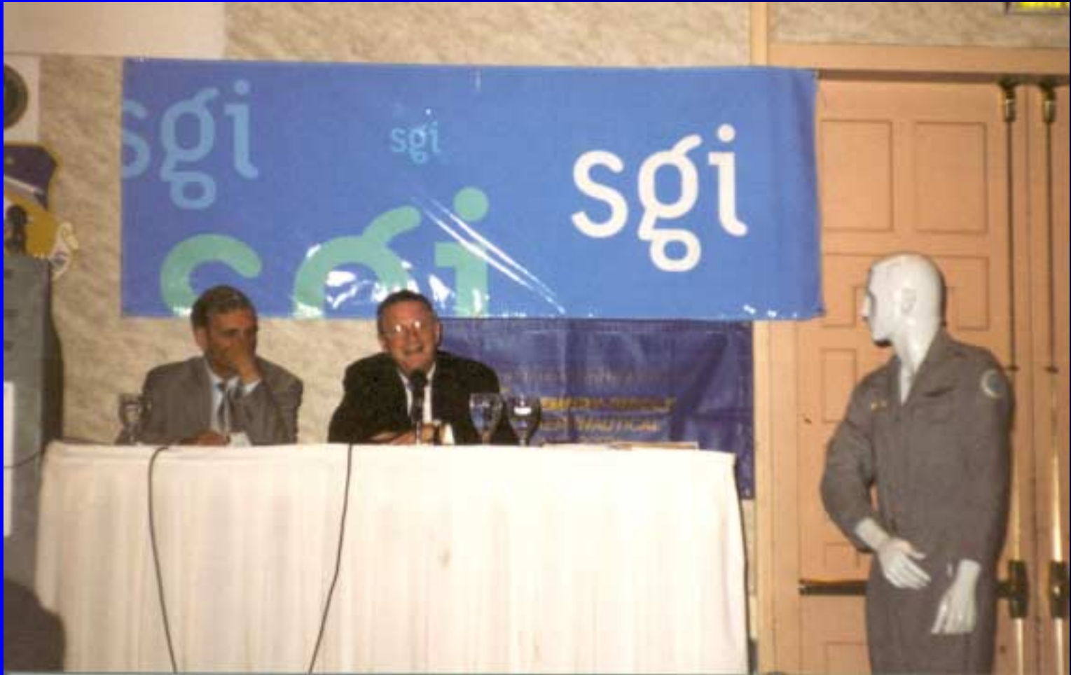
Keir Dullea and Dan Richter at the “2001: A Space Odyssey” banquet. Right side of photo: the coveralls worn by Keir Dullea during filming of the movie.