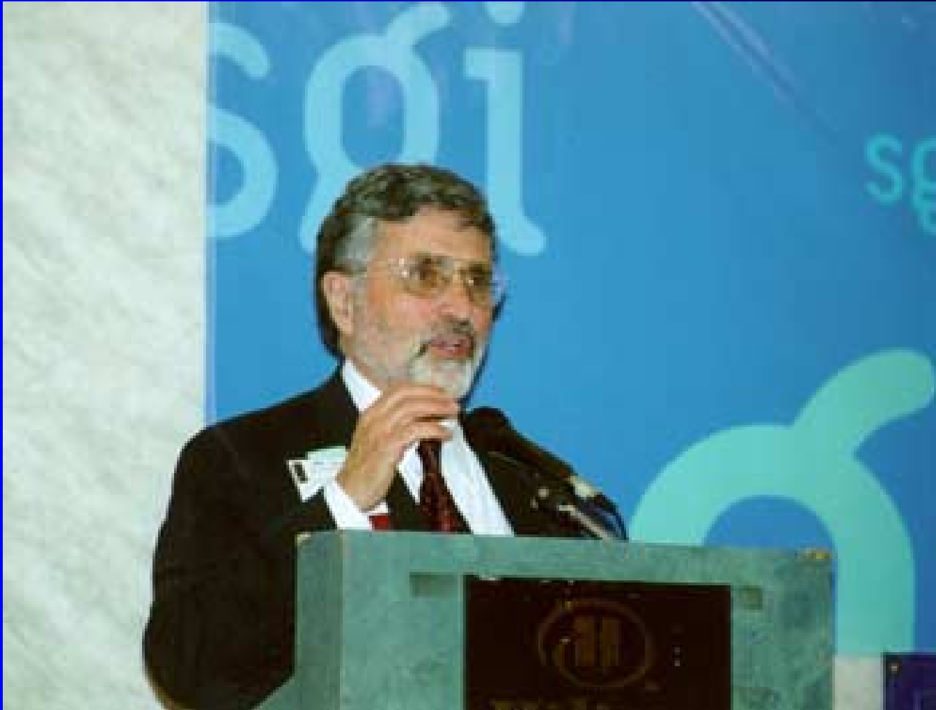
Astronaut Harrison 'Jack' Schmitt as the Emcee of the Progression of Human Spaceflight banquet