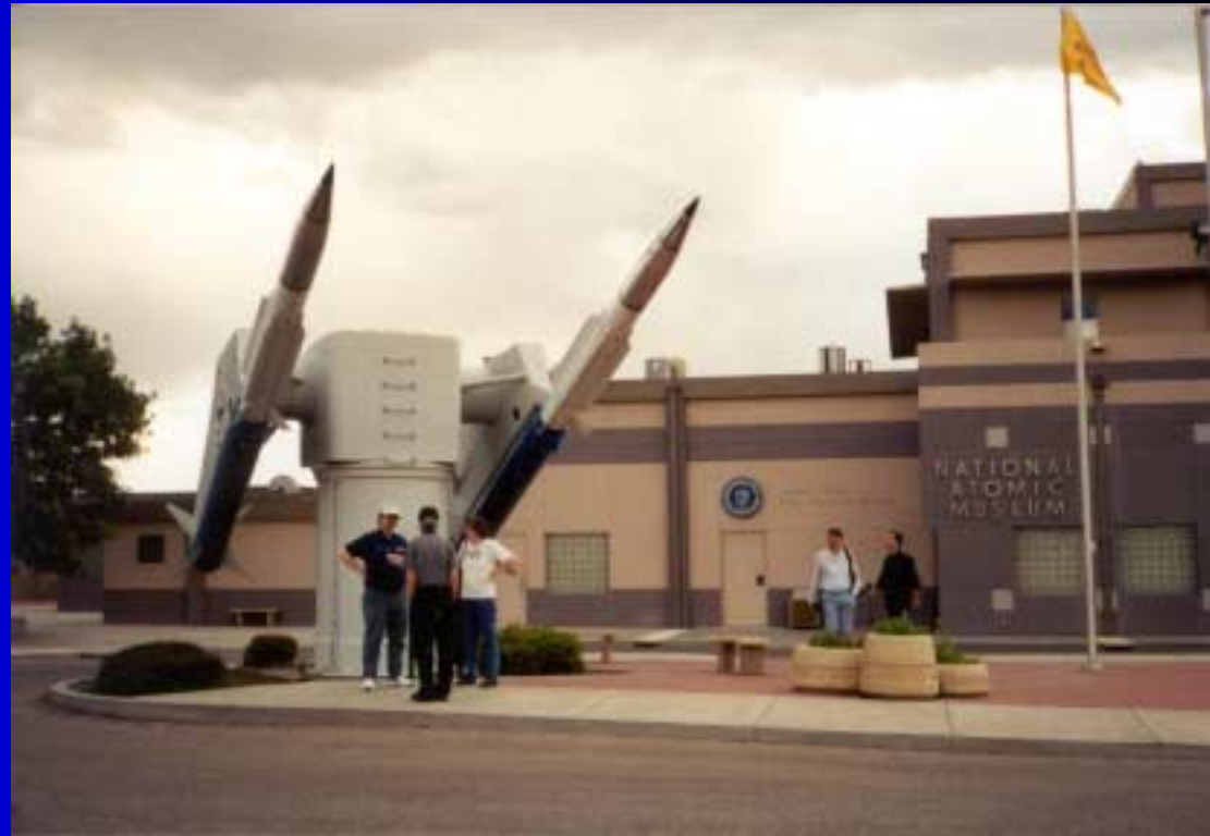
National Atomic Museum Tour