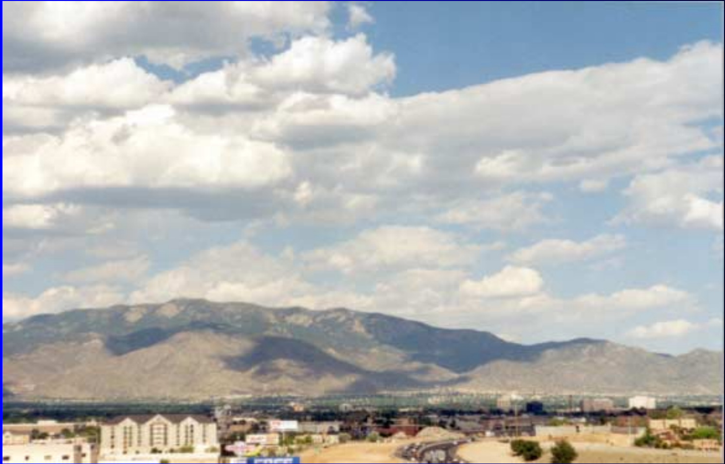
View of Sandia Peak from the top floor of the Albuquerque Hilton, site of ISDC 2001