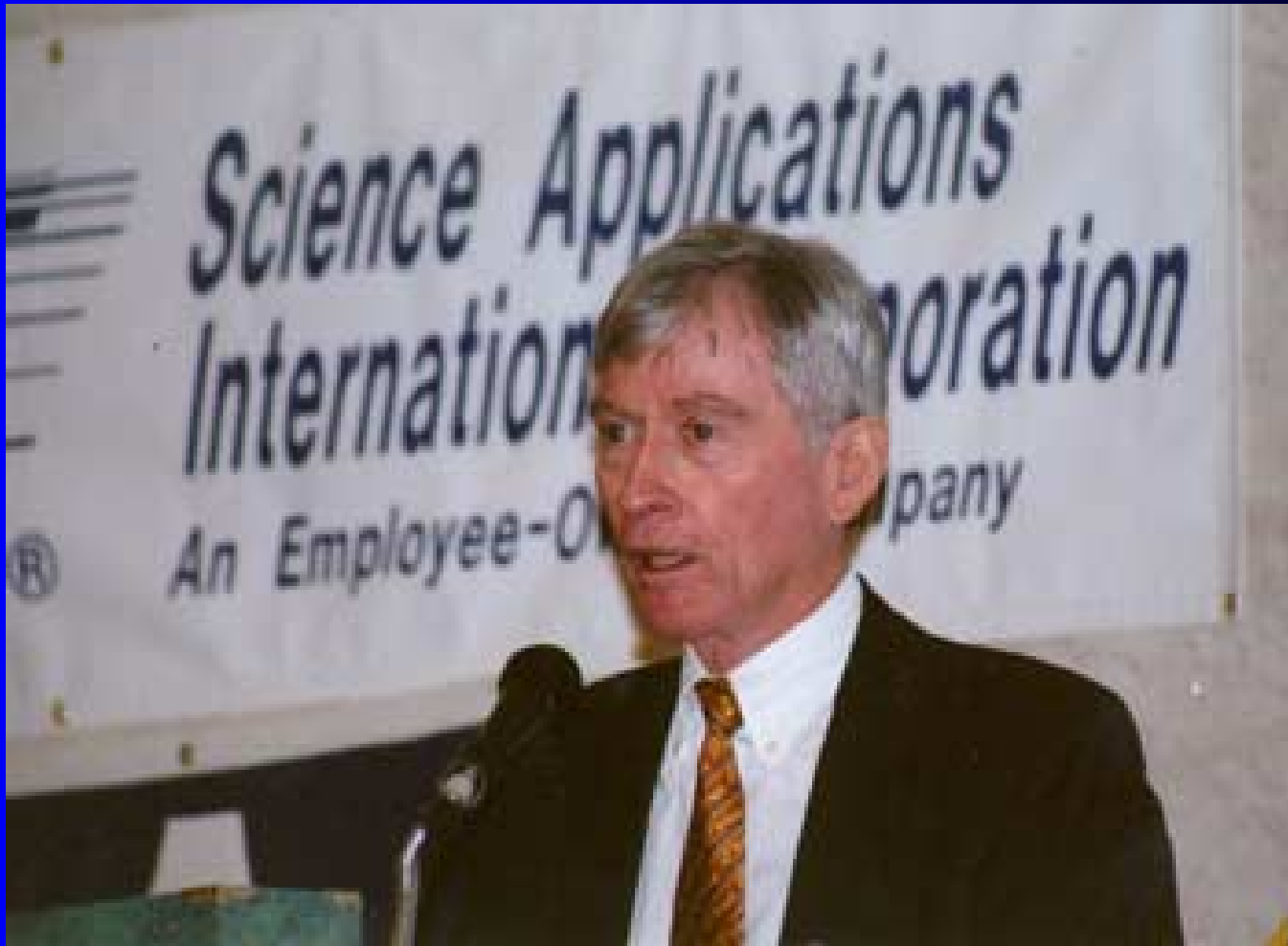
Astronaut John Young, speaking at the "Hail Columbia: 20th Anniversary of STS-1" luncheon