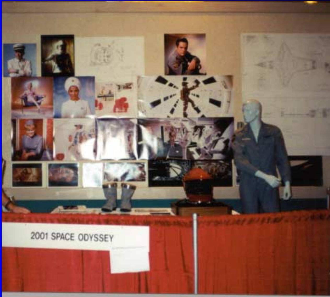
“2001: A Space Odyssey” exhibit, including the boots, red space helmet, and coveralls worn by Keir Dullea during filming of the movie.